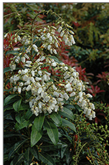
Mountain Fire Japanese Pieris flowers