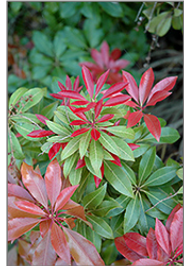
Valley Valentine Japanese Pieris foliage

* This is a 'special order' plant - contact store for details