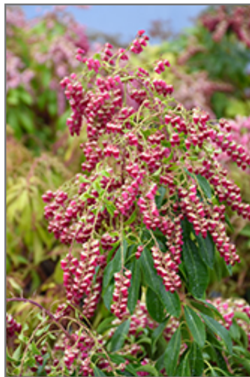
Valley Valentine Japanese Pieris flowers