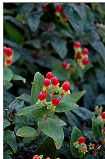
Ignite Red St. John's Wort fruit

Ignite Red St. John's Wort will grow to be about 3 feet tall at maturity, with a spread of 3 feet. It tends to fill out right to the ground and therefore doesn't necessarily require facer plants in front. It grows at a medium rate, and under ideal conditions can be expected to live for approximately 5 years.