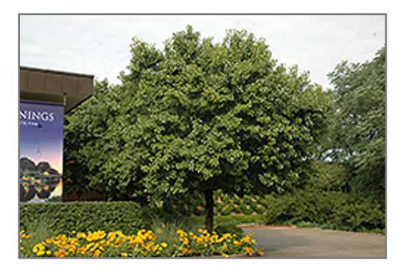
Autumn Blaze Ornamental Pear