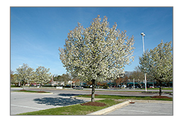
Autumn Blaze Ornamental Pear in bloom