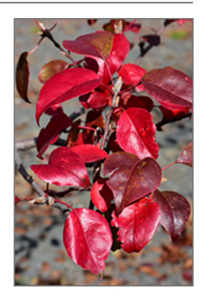
Autumn Blaze Ornamental Pear in fall

* This is a 'special order' plant - contact store for details