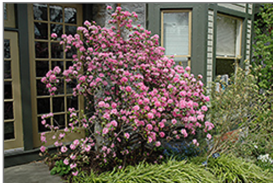
Olga Mezitt Rhododendron in bloom