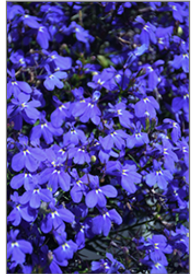
Techno Blue Lobelia flowers