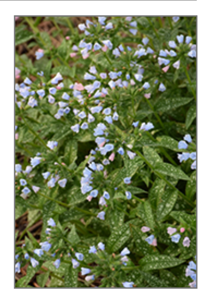
Bertram Anderson Lungwort flowers