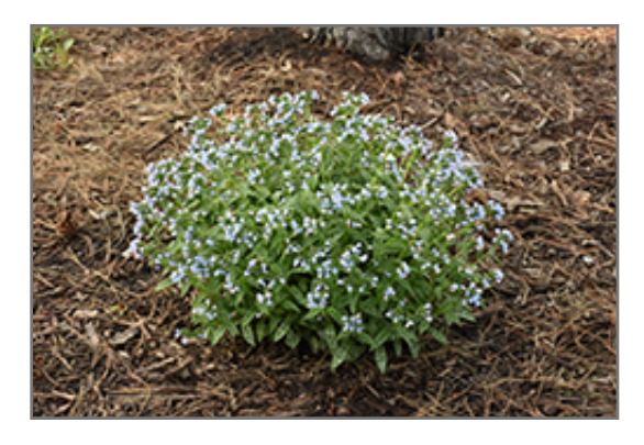
Bertram Anderson Lungwort in bloom