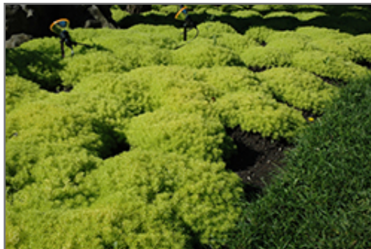
Lemon Ball Stonecrop