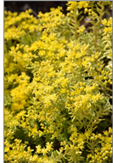
Lemon Ball Stonecrop flowers

This plant does best in full sun to partial shade. It prefers dry to average moisture levels with very well-drained soil, and will often die in standing water. It is considered to be drought-tolerant, and thus makes an ideal choice for a low-water garden or xeriscape application. It is not particular as to soil pH, but grows best in poor soils, and is able to handle environmental salt. It is highly tolerant of urban pollution and will even thrive in inner city environments. This is a selected variety of a species not originally from North America. It can be propagated by division; however, as a cultivated variety, be aware that it may be subject to certain restrictions or prohibitions on propagation.