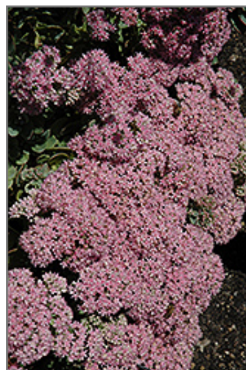
Lime Zinger Stonecrop flowers

Lime Zinger Stonecrop is recommended for the following landscape applications;