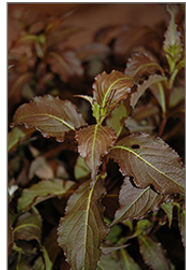
Spilled Wine Weigela foliage