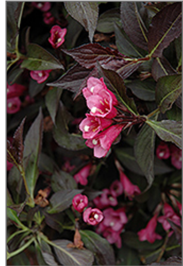
Spilled Wine Weigela flowers

Spilled Wine Weigela makes a fine choice for the outdoor landscape, but it is also well-suited for use in outdoor pots and containers. Because of its height, it is often used as a 'thriller' in the 'spiller-thriller-filler' container combination; plant it near the center of the pot, surrounded by smaller plants and those that spill over the edges. Note that when grown in a container, it may not perform exactly as indicated on the tag - this is to be expected. Also note that when growing plants in outdoor containers and baskets, they may require more frequent waterings than they would in the yard or garden.