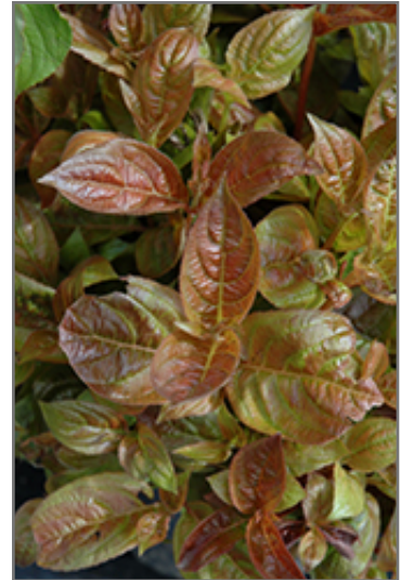
Wings Of Fire Weigela foliage