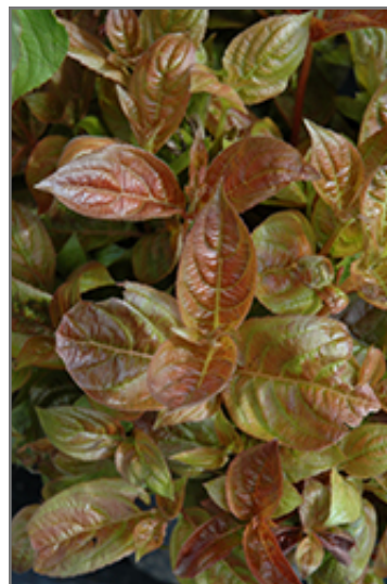
Wings Of Fire Weigela foliage