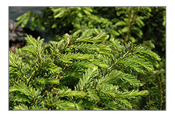
Emerald Spreader Yew foliage

109 Highland Ave. Scarborough, ME, 04074 phone: 207-883-2861 highlandavegreenhouse.com