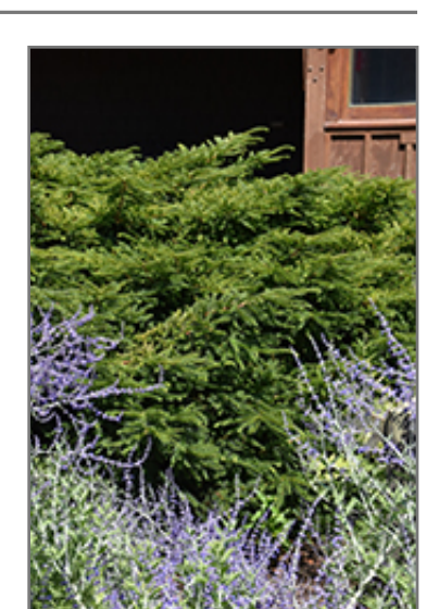
Emerald Spreader Yew