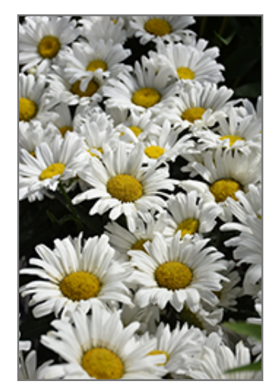
Daisy May Shasta Daisy flowers