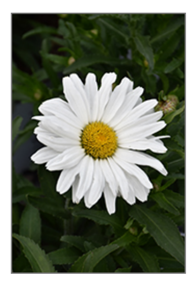
Daisy May Shasta Daisy flowers