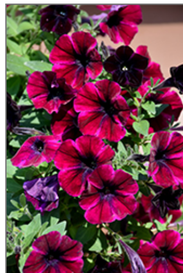
Sweetunia Johnny Flame Petunia flowers