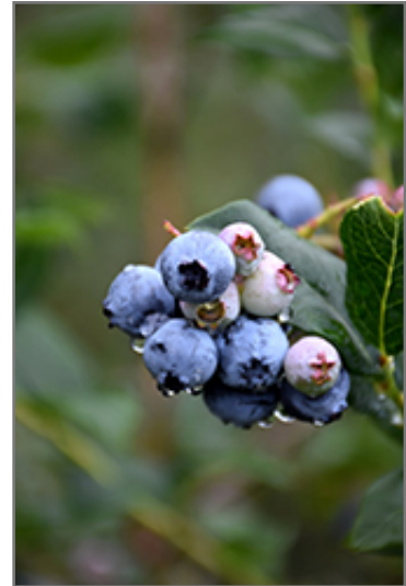
Chippewa Blueberry fruit

This is a multi-stemmed deciduous shrub with an upright spreading habit of growth. Its relatively fine texture sets it apart from other landscape plants with less refined foliage. This is a relatively low maintenance plant, and usually looks its best without pruning, although it will tolerate pruning. It is a good choice for attracting birds to your yard. It has no significant negative characteristics.