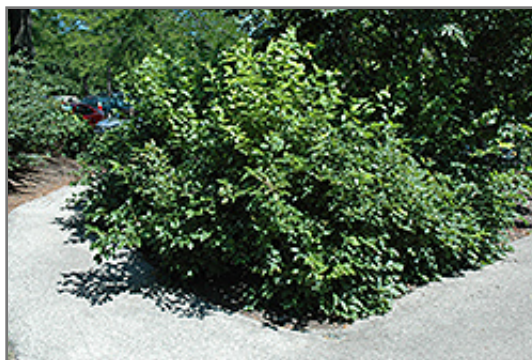
Chicago Lustre Viburnum