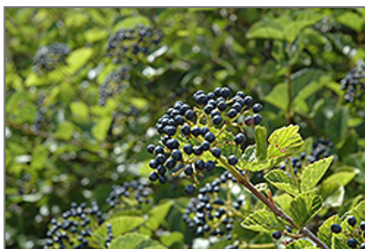
Chicago Lustre Viburnum fruit