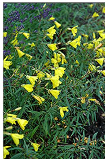
Lemon Drop Primrose flowers