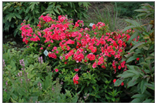
Coral Flame Garden Phlox in bloom