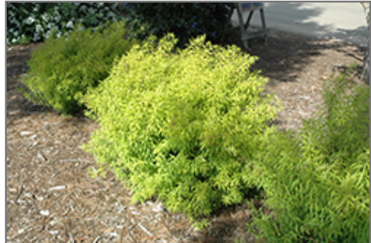
Mellow Yellow Spirea