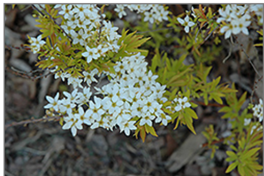
Mellow Yellow Spirea flowers