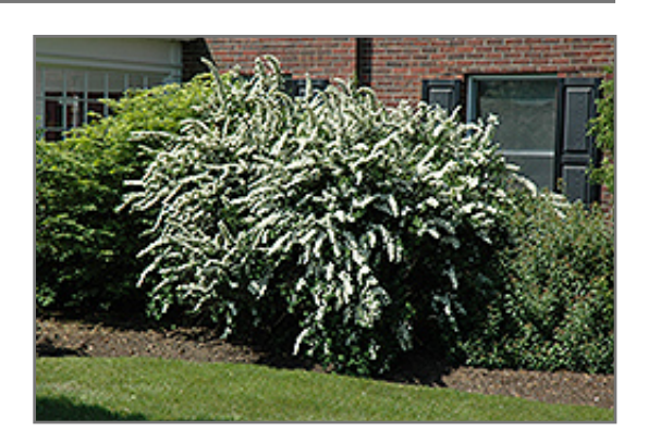
Renaissance Spirea in bloom