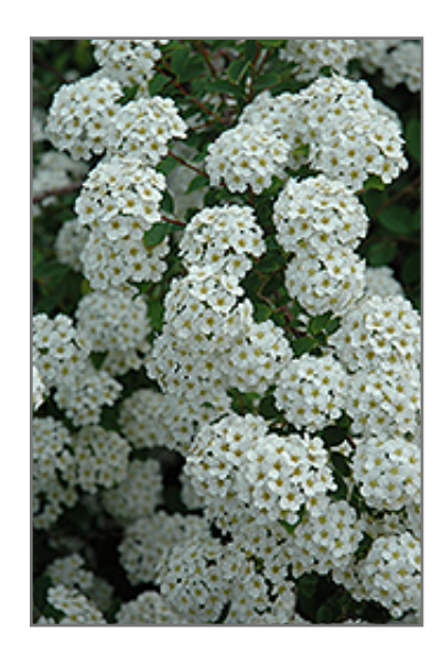
Renaissance Spirea flowers