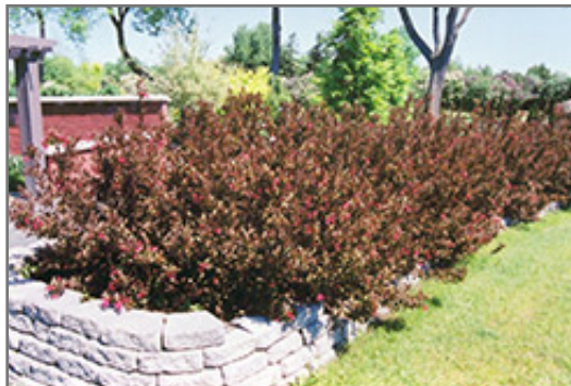
Wine and Roses Weigela