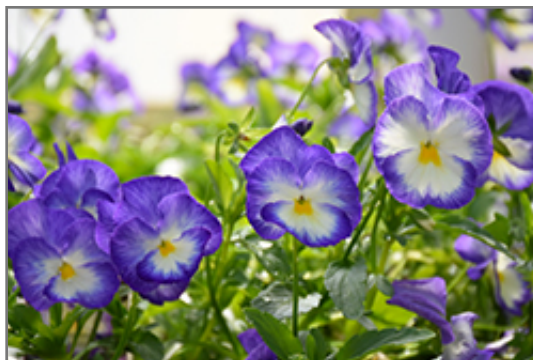
Halo Lilac Pansy flowers

Halo Lilac Pansy is recommended for the following landscape applications;