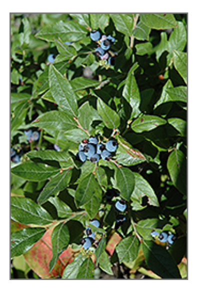
Lowbush Blueberry fruit

Lowbush Blueberry features dainty clusters of white bell-shaped flowers with shell pink overtones hanging below the branches in mid spring. It has dark green deciduous foliage. The oval leaves turn an outstanding scarlet in the fall. It features an abundance of magnificent blue berries in mid summer.