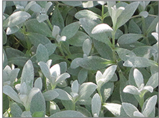
Snow-In-Summer foliage

This plant should only be grown in full sunlight. It prefers dry to average moisture levels with very well-drained soil, and will often die in standing water. It is considered to be drought-tolerant, and thus makes an ideal choice for a low-water garden or xeriscape application. It is not particular as to soil type or pH. It is highly tolerant of urban pollution and will even thrive in inner city environments. This species is not originally from North America. It can be propagated by division.