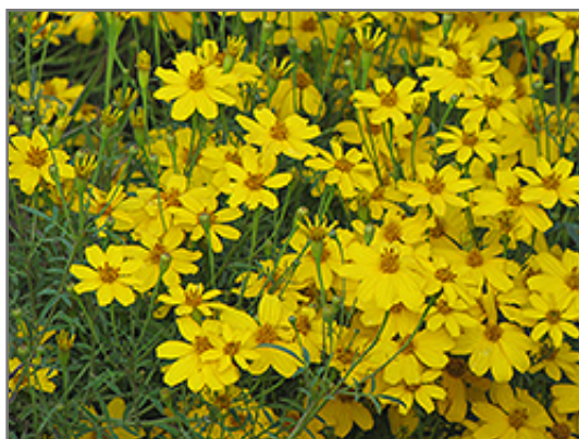
Zagreb Tickseed flowers

Zagreb Tickseed will grow to be about 18 inches tall at maturity, with a spread of 18 inches. Its foliage tends to remain dense right to the ground, not requiring facer plants in front. It grows at a medium rate, and under ideal conditions can be expected to live for approximately 15 years.