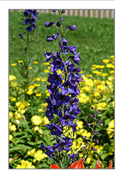
Pacific Giant Black Knight Larkspur flowers