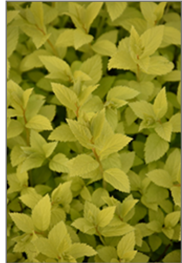
Double Play Gold Spirea foliage

This shrub should only be grown in full sunlight. It prefers to grow in average to moist conditions, and shouldn't be allowed to dry out. It is not particular as to soil type or pH. It is highly tolerant of urban pollution and will even thrive in inner city environments. This is a selected variety of a species not originally from North America.