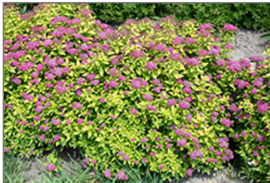
Double Play Gold Spirea in bloom