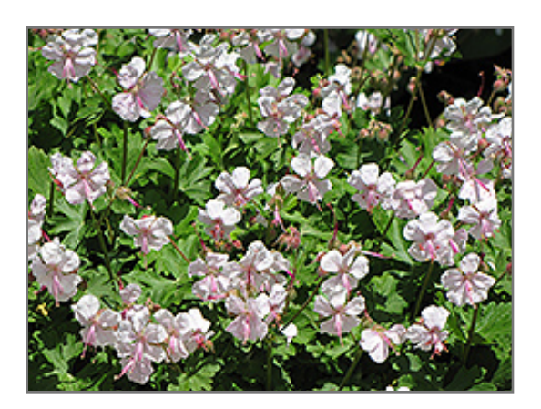
Biokovo Cranesbill in bloom

Biokovo Cranesbill is recommended for the following landscape applications;