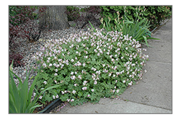
Biokovo Cranesbill in bloom