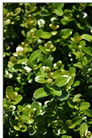
Sprinter Boxwood foliage