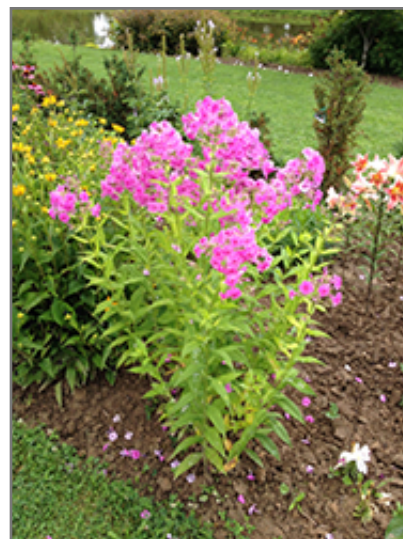
Peacock Rose Dark Eye Garden Phlox in bloom