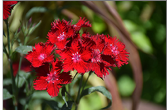
Rockin' Red Pinks flowers

Rockin' Red Pinks is recommended for the following landscape applications;