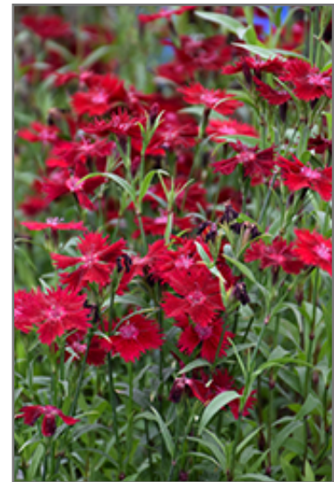
Rockin' Red Pinks flowers