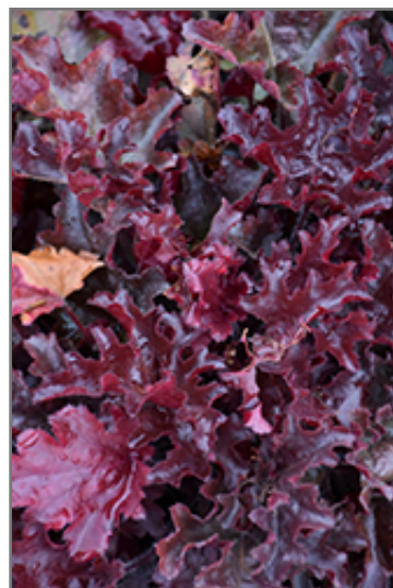
Dolce Cherry Truffles Coral Bells foliage