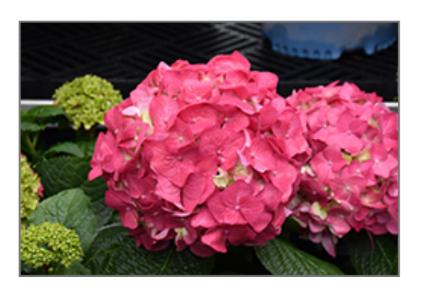
Summer Crush Hydrangea flowers