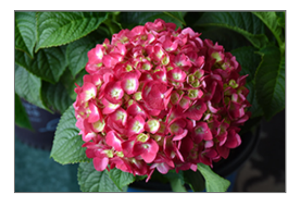
Summer Crush Hydrangea flowers