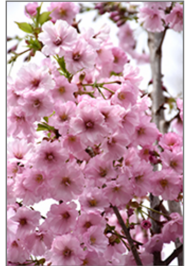
First Blush Flowering Cherry flowers

First Blush Flowering Cherry will grow to be about 25 feet tall at maturity, with a spread of 12 feet. It has a low canopy with a typical clearance of 5 feet from the ground, and is suitable for planting under power lines. It grows at a medium rate, and under ideal conditions can be expected to live for 50 years or more.