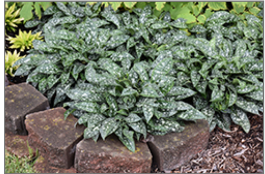
Twinkle Toes Lungwort

Twinkle Toes Lungwort will grow to be about 12 inches tall at maturity, with a spread of 18 inches. When grown in masses or used as a bedding plant, individual plants should be spaced approximately 15 inches apart. Its foliage tends to remain dense right to the ground, not requiring facer plants in front. It grows at a medium rate, and under ideal conditions can be expected to live for approximately 10 years. As an herbaceous perennial, this plant will usually die back to the crown each winter, and will regrow from the base each spring. Be careful not to disturb the crown in late winter when it may not be readily seen!