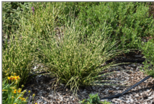
Bandwidth Maiden Grass