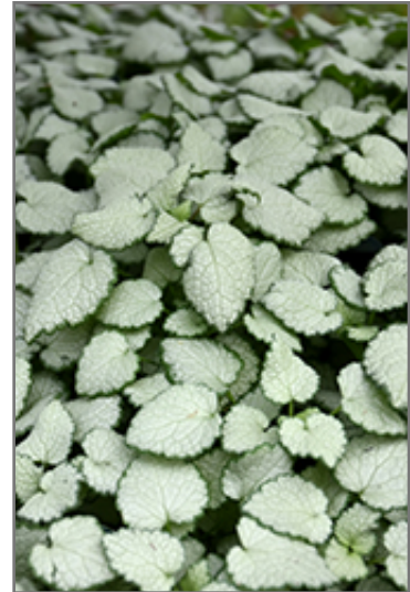
Red Nancy Spotted Dead Nettle foliage

Red Nancy Spotted Dead Nettle is a fine choice for the garden, but it is also a good selection for planting in outdoor pots and containers. Because of its spreading habit of growth, it is ideally suited for use as a 'spiller' in the 'spiller-thriller-filler' container combination; plant it near the edges where it can spill gracefully over the pot. Note that when growing plants in outdoor containers and baskets, they may require more frequent waterings than they would in the yard or garden.