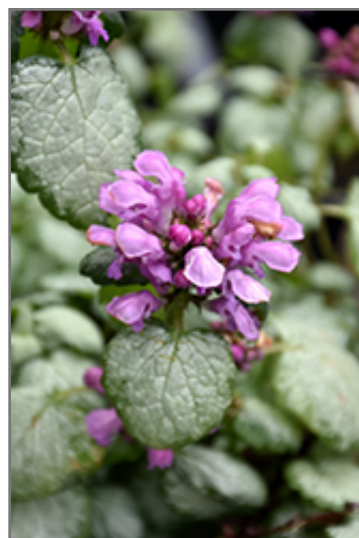
Red Nancy Spotted Dead Nettle flowers