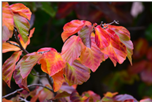
Persian Parrotia in fall