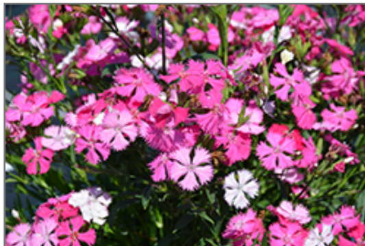
Rockin' Pink Magic Pinks flowers