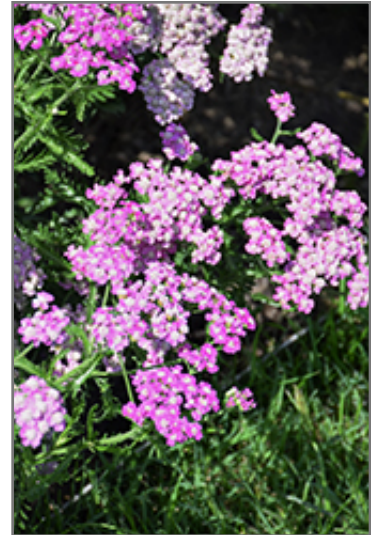
Firefly Amethyst Yarrow flowers

Firefly Amethyst Yarrow is recommended for the following landscape applications;