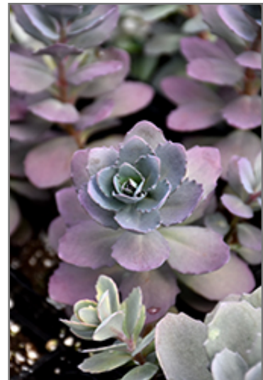
Plum Dazzled Stonecrop foliage