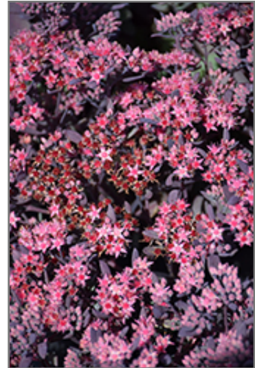
Plum Dazzled Stonecrop flowers

Plum Dazzled Stonecrop is a dense herbaceous perennial with an upright spreading habit of growth. Its medium texture blends into the garden, but can always be balanced by a couple of finer or coarser plants for an effective composition.