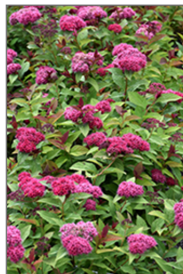
Double Play Doozie Spirea flowers