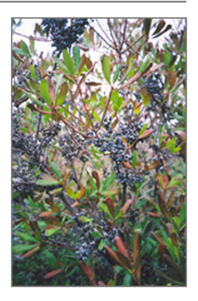
Northern Bayberry fruit

This shrub does best in full sun to partial shade. It does best in average to evenly moist conditions, but will not tolerate standing water. It is very fussy about its soil conditions and must have sandy, acidic soils to ensure success, and is subject to chlorosis (yellowing) of the foliage in alkaline soils, and is able to handle environmental salt. It is highly tolerant of urban pollution and will even thrive in inner city environments. This species is native to parts of North America.