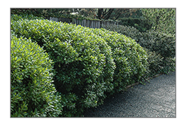
Northern Bayberry

109 Highland Ave. Scarborough, ME, 04074 phone: 207-883-2861 highlandavegreenhouse.com