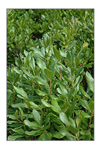
Northern Bayberry foliage