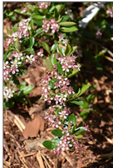
Ground Hug Aronia flowers