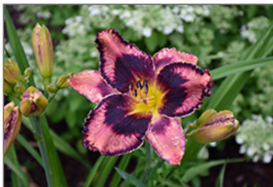
Rainbow Rhythm Storm Shelter Daylily flowers