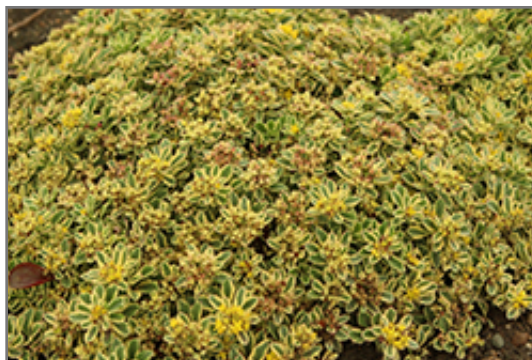
Rock 'N Low Boogie Woogie Stonecrop flowers

This is a relatively low maintenance plant, and is best cleaned up in early spring before it resumes active growth for the season. It is a good choice for attracting bees and butterflies to your yard, but is not particularly attractive to deer who tend to leave it alone in favor of tastier treats. It has no significant negative characteristics.