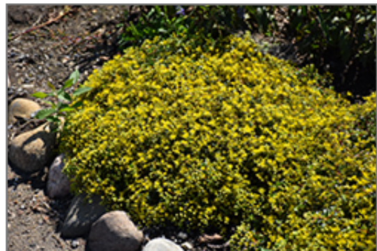
Rock 'N Low Yellow Brick Road Stonecrop in bloom