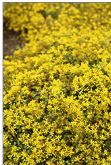
Rock 'N Low Yellow Brick Road Stonecrop flowers

Rock 'N Low Yellow Brick Road Stonecrop is recommended for the following landscape applications;