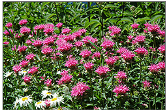
Marshall's Delight Beebalm flowers