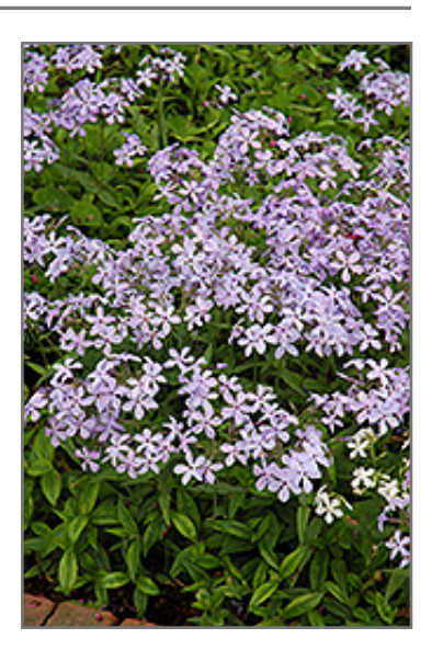
Woodland Phlox flowers

Woodland Phlox will grow to be about 8 inches tall at maturity, with a spread of 18 inches. When grown in masses or used as a bedding plant, individual plants should be spaced approximately 16 inches apart. Its foliage tends to remain low and dense right to the ground. It grows at a medium rate, and under ideal conditions can be expected to live for approximately 10 years. As an herbaceous perennial, this plant will usually die back to the crown each winter, and will regrow from the base each spring. Be careful not to disturb the crown in late winter when it may not be readily seen!