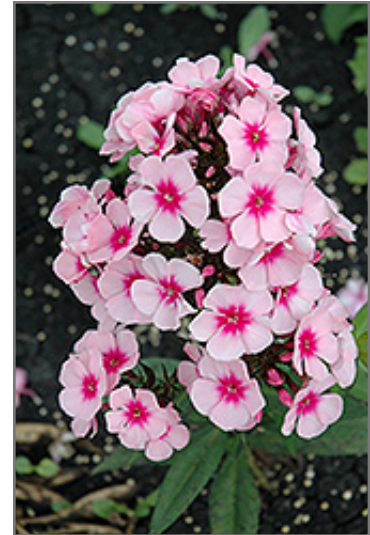
Bright Eyes Garden Phlox flowers

Bright Eyes Garden Phlox is a fine choice for the garden, but it is also a good selection for planting in outdoor pots and containers. With its upright habit of growth, it is best suited for use as a 'thriller' in the 'spiller-thriller-filler' container combination; plant it near the center of the pot, surrounded by smaller plants and those that spill over the edges. It is even sizeable enough that it can be grown alone in a suitable container. Note that when growing plants in outdoor containers and baskets, they may require more frequent waterings than they would in the yard or garden.