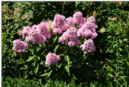
Bright Eyes Garden Phlox in bloom